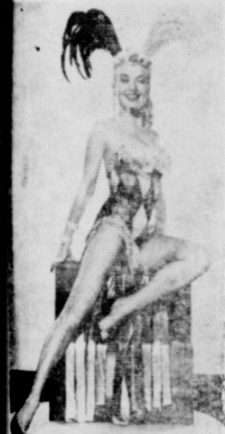
BETTY GRABLE—America's All-Time Fashions Queen will headline the "Betty Grable-Harry James Show" at the Lubbock Auditorium on April 30-31-2. This will be their only Southwestern appearance.