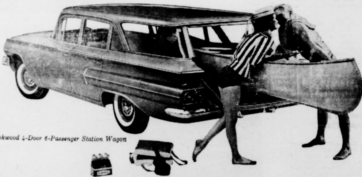
Brookwood 4-Door 6-Passenger Station Wagon

See The Dinah Shore Chevy Show in color Sundays, NBC-TV— the Pat Boone Chevy Showroom weekly, ABC-TV.