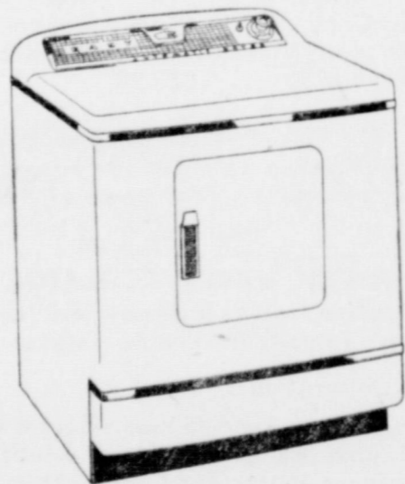
ILLUSTRATED ABOVE IS AN EASY AUTOMATIC GAS CLOTHES DRYER.