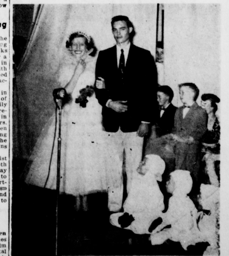
Above is a scene from the recent Halloween Carnival.