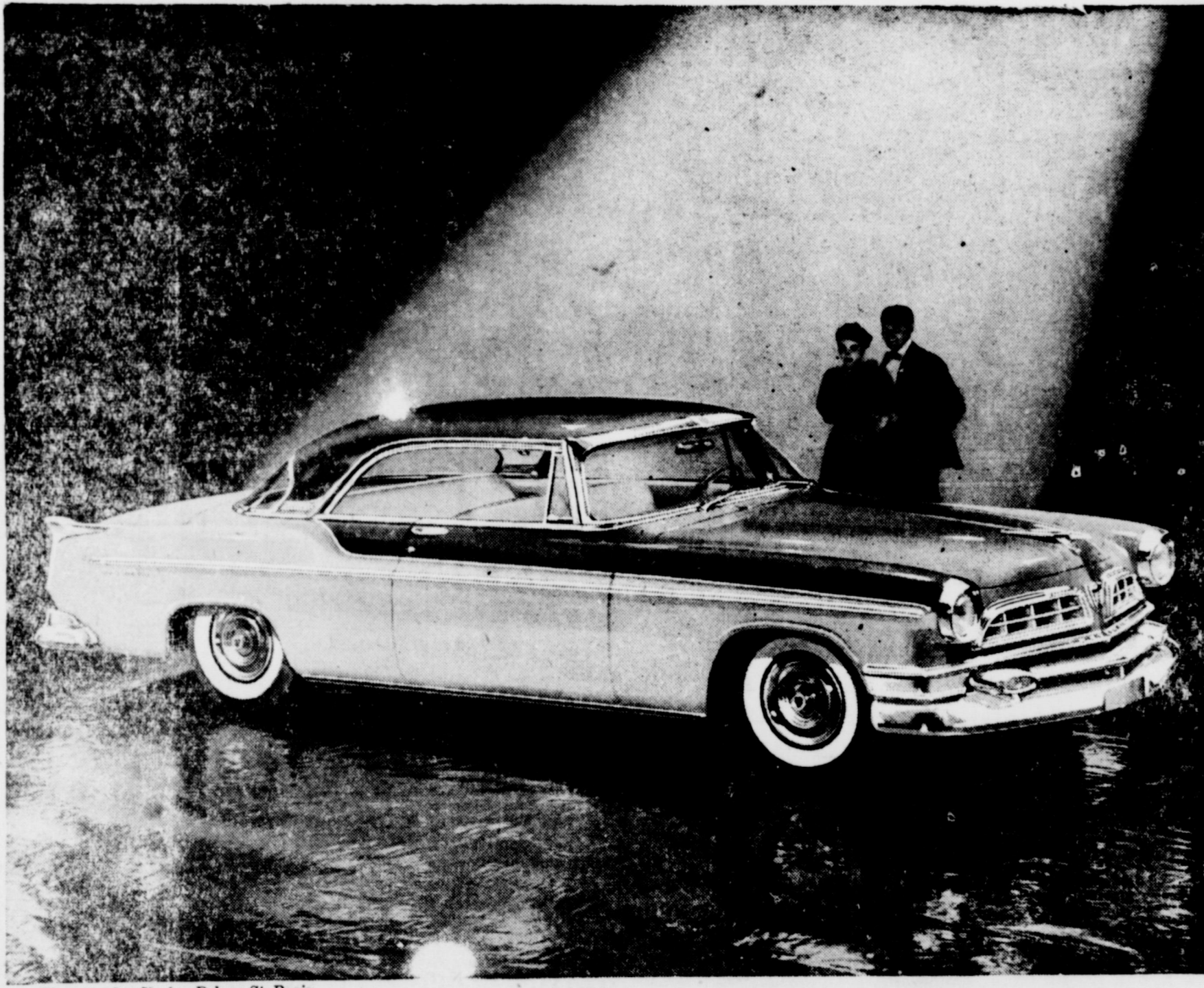
Chrysler New Yorker Deluze St. Regis

1 1/2-POUND AND 3-POUND BOTTLES... 5- AND 10-POUND CANS