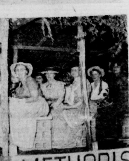
Above are floats appearing in rodeo parades here in past years. This year's parade promises to be even better.