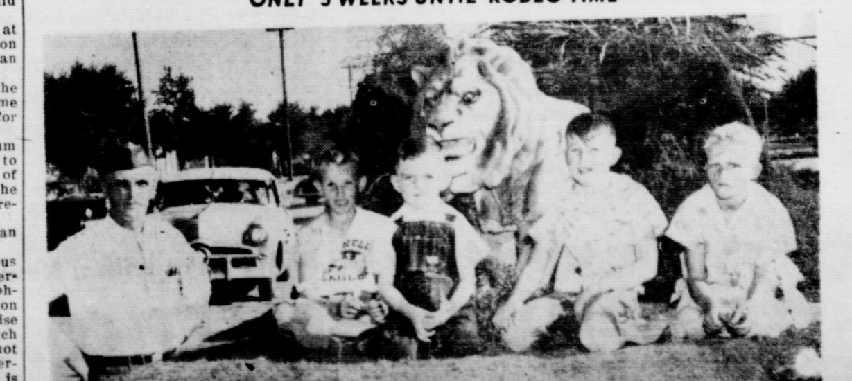
A lot of work is ahead of various civic groups in preparing for our annual fiesta . . . 5 weeks away