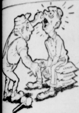
There's a Better Way

A construction worker may know a lot about skills but he's not the man you'd go to for dental treatment.