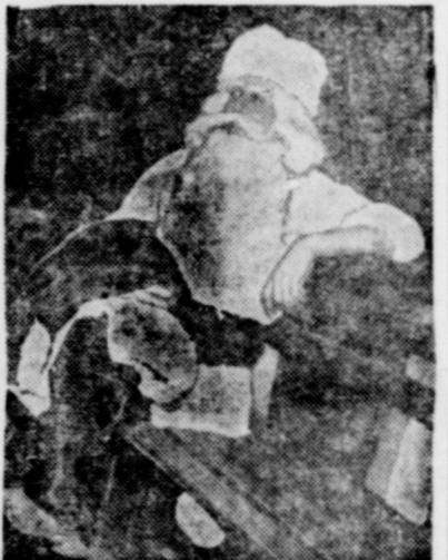
SHIRT-SLEEVED SANTA . . . It's not a common subject for discussion, but Santa Claus sometimes does take off his coat and just lounge around in his beard and shirtsleeves. However, this is not standard procedure, and it's mighty few Santas you see sitting on a park bench in New York.