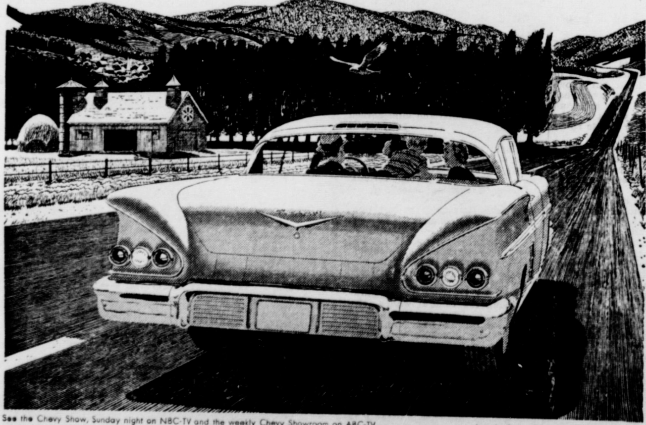
See the Chevy Show, Sunday night on NBC-TV and the weekly Chevy Showroom on ABC-TV. Ingle Sport Coupe with Body by Fisher.

See your local authorized Chevrolet dealer ELLIS CHEVROLET CO. Phone 124, O'Donnell, Texas