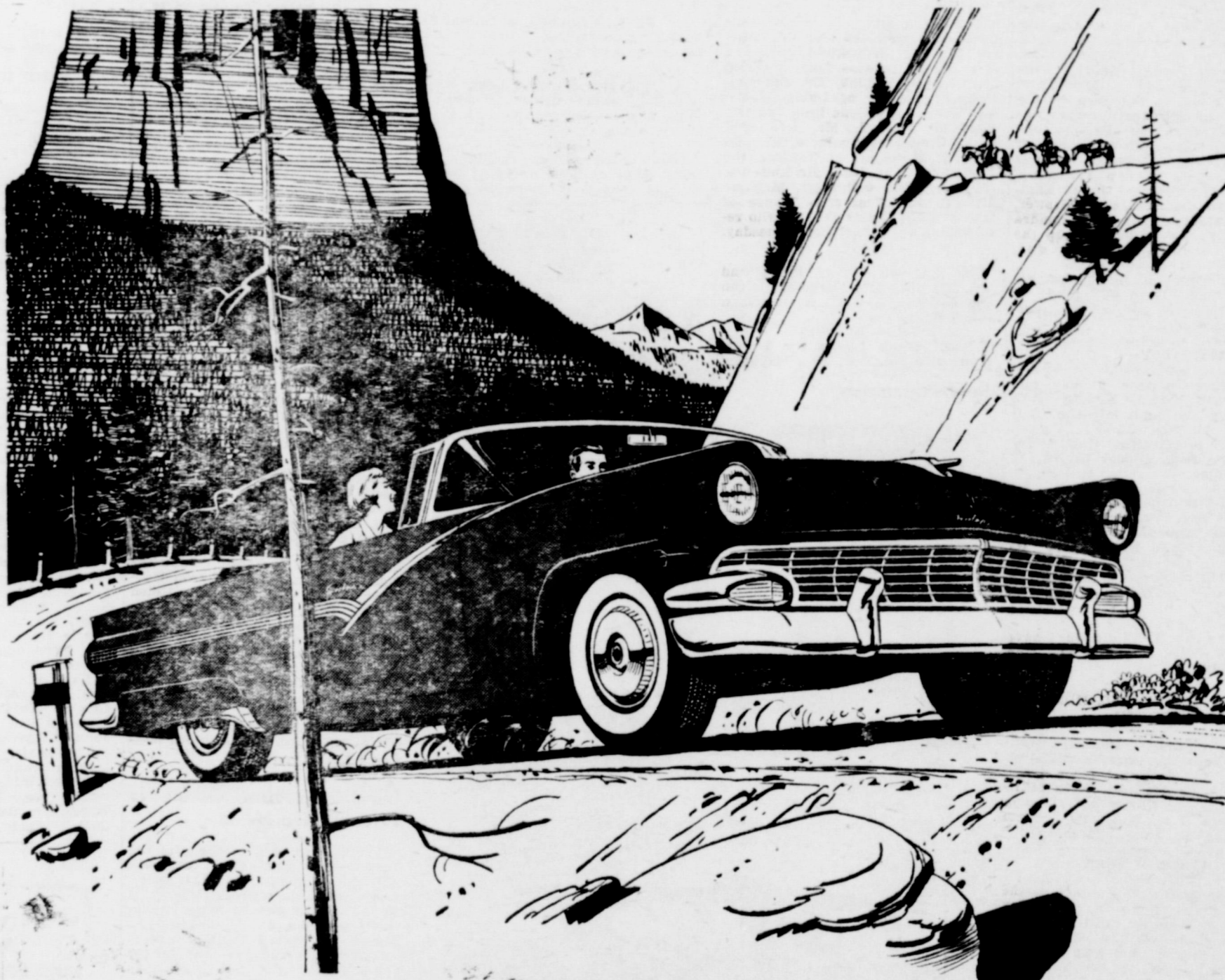
In looks, too, Ford's out-front—with styling that only the Thunderbird could inspire