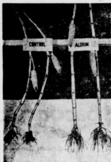
Note the fuller roots, larger ears and straight stalks of the corn grown in soil treated by the new chemical.

The new insecticide may be applied by any method available to the average farmer; by mixing with starter fertilizer, with manure, or