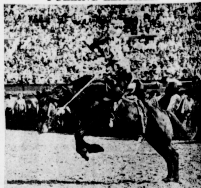
This convict rider shows great skill and balance in the Saddle Bronc Bustin' Contest, one of the many thrilling features of the 26th annual Texas Prison Rodeo in the prison's million- dollar stadium at Huntsville. The rodeo is held each Sunday dur- ing October beginning at 2 p.m.