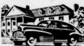
More Value in Beauty and Luxury

There's nothing like Chevrolet's world's champion Valve-in-Head engine . . . with its record of having delivered more miles of satisfaction, to more owners, over a longer period, than any other engine built today . . . and Valve-in-Head design is exclusive to Chevrolet and higher-priced cars!