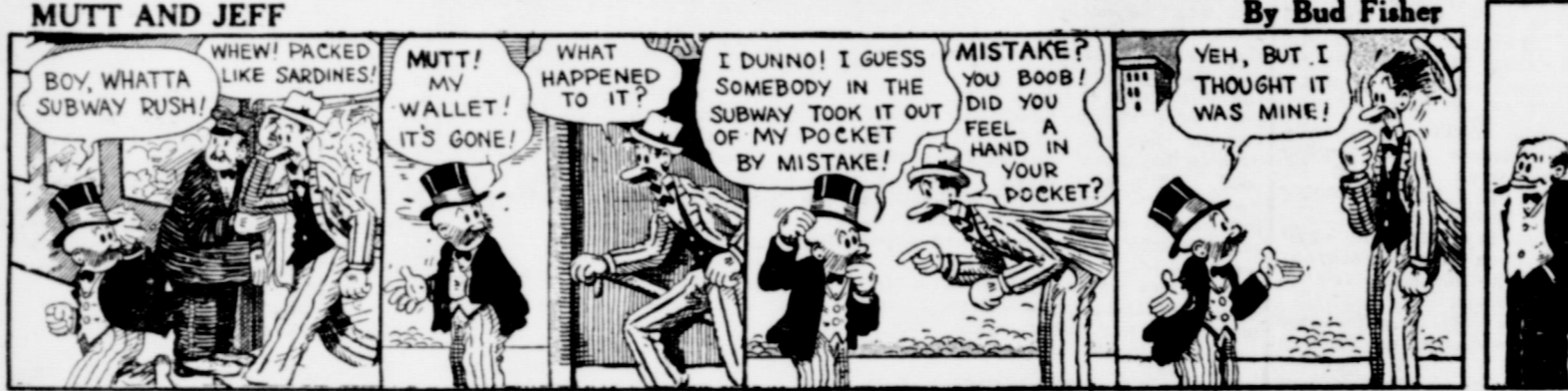
MUTT AND JEFF