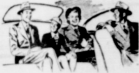
More Value in Riding Comfort

You'll find that Chevrolet gives more riding-smoothness, more riding-steadiness, on all kinds of roads because it has the original Unitized Knee-Action Ride, proved and perfected by 14 years of experience in building Knee-Action units. Available only in Chevrolet and higher-priced cars!