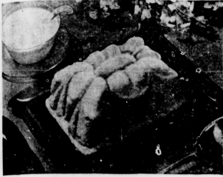
Families Enjoy Variety in Desserts! (See Recipes Below)