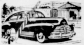
More Value in All-round Safety

You'll find that Chevrolet gives more riding-smoothness, more riding-steadiness, on all kinds of roads because it has the original Unitized Knee-Action Ride, proved and perfected by 14 years of experience in building Knee-Action units. Available only in Chevrolet and higher-priced cars!