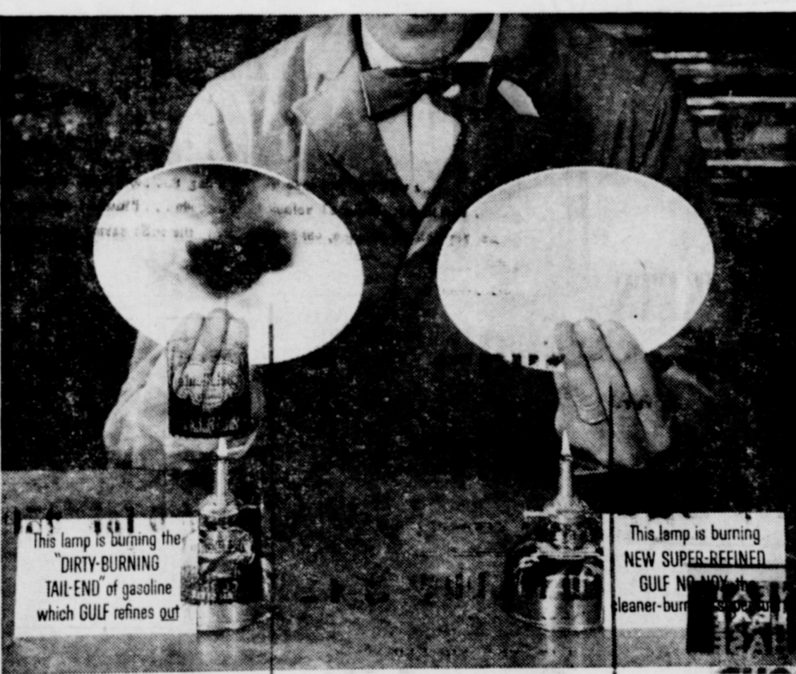
This lamp is burning the "DIRTY-BURNING TAIL-END" of gasoline which GULF refines out

► Now—Gulf refines out the "dirty-burning tail-end" of gasoline—the No. 1 trouble-maker in high-compression engines. Result: a cleaner-burning super-fuel that gives you thousands of extra miles of full engine power... free from knock or pre-ignition.