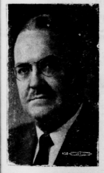
TO LYNN COUNTY VOTERS:

Taking the position that you may not have given much thought to the candidates for Place 3 on the Supreme Court of Texas, we most respectfully recommend for your consideration the candidacy of JUDGE NORVELL. . . He is —