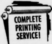
THE BAIRD STAR