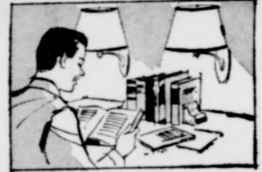
Two wall lamps with 100-watt bulbs in diffusing bowls may be used when study table is placed against a light-colored wall.

TEXAS ELECTRIC SERVICE COMPANY W. B. MITCHEL, Manager Phone 60