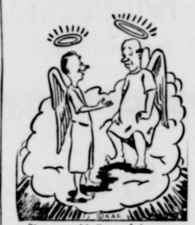
"Sure scared hell out of that train engineer."

COME IN PLEASE DRIVE OUT PLEASE QUICK SERVICE! DEALER OF HUMBLE PRODUCTS