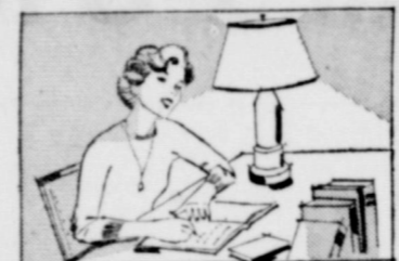
For best light from a table lamp, use a 150-watt bulb. A diffusing bowl is recommended to prevent glare.

You'll be giving your youngsters real help with their homework when you provide them with proper study light. Good light helps prevent eye fatigue ... aids concentration ... encourages good study habits that lead to better grades. Check your children's study light now. Make sure they have enough light and the right kind of light for easy, comfortable seeing.