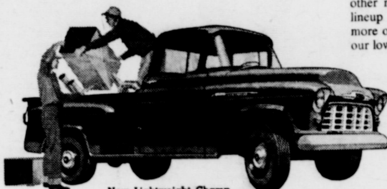
New Lightweight Champ

They bring you today's most advanced features for fast-working peak efficiency on any kind of job! They've got the most modern short-stroke V8 engines—packing more power per pound than any competitive truck V8. (Standard in many middleweights and all heavies; optional at extra cost in other models.) They've got the industry's greatest lineup of transmissions! They're fully loaded with more of the things you want! Whatever you do, get our low price before you buy!