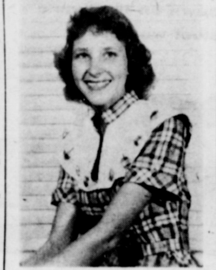
McLAURIN REUNION HELD