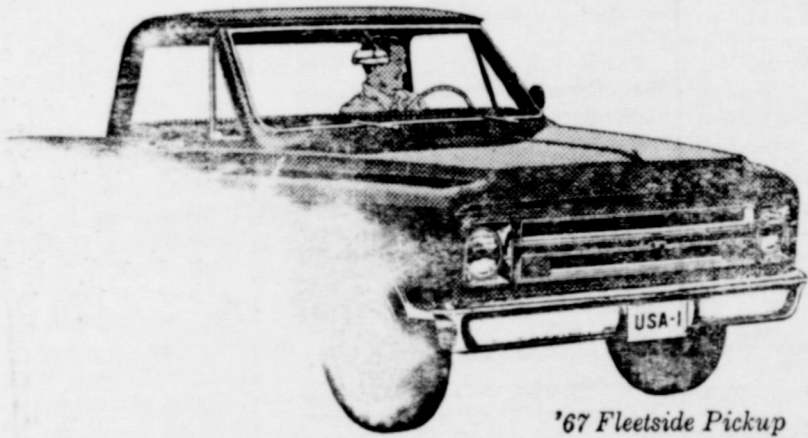
'67 Fleetside Pickup

Its new look is just the nice thing about the '67 Chevy pickup