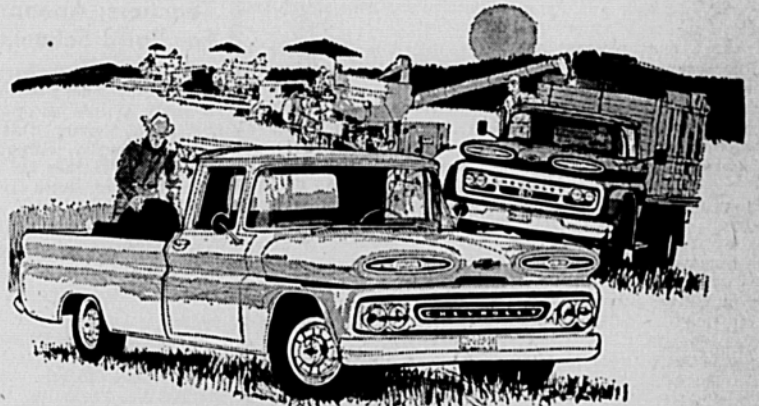
Fleetside Pickup and Series 60 with high rack