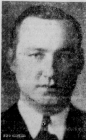
JERRY SADLER FOR GOVERNOR