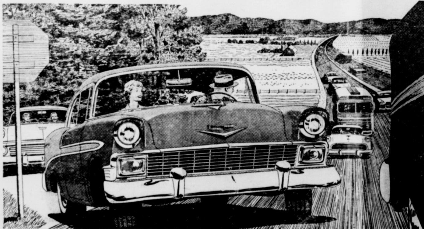
THE BEL AIR SPORT COUPE—one of 19 high-priced-looking Chevrolets, all with Body by Fisher.

Speaks softly and packs a powerful wallop!