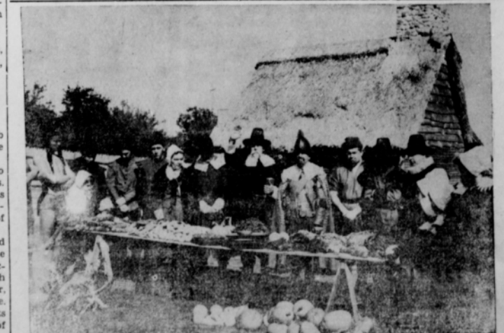
Although the First Thanksgiving was a harvest festival, the Pilgrims blessed their food and thanked God for a bountiful harvest.