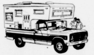
INTERNATIONAL® CAMPER SPECIAL