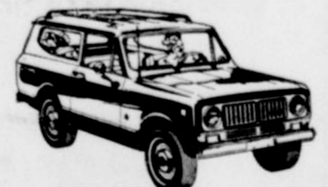
SCOUT® ... by International®