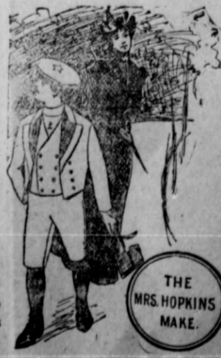
THE MRS. HOPKINS MAKE.

We have a big stock and are offering them at low prices. We want your fall business come give us a look.