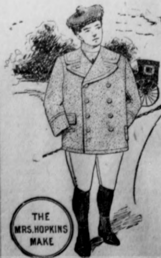
THE MRS. HOPKINS MAKE.

The blanket season is now here and we want you to look at our beautiful line of white bed blankets at 4, 5, $6.50 in 10x4 and 11x4, we also have a fine line of colored blankets.