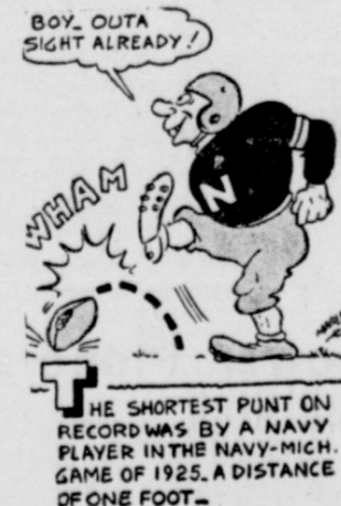
THE SHORTEST PUNT ON RECORD WAS BY A NAVY PLAYER IN THE NAVY-MICH. GAME OF 1925. A DISTANCE OF ONE FOOT.