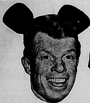
Don't miss JIMMIE DODD in the WEATHER-BIRD MICKEY MOUSE TV SHOW on (Day), Station 0000-TV

West Third — AIR CONDITIONED — Sam Gilliland Building