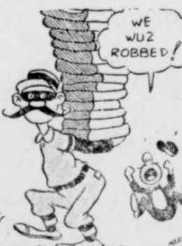
ALL PLAYER HARRY STOVEY STOLE 156 BASES DURING ONE SEASON IN 1889...