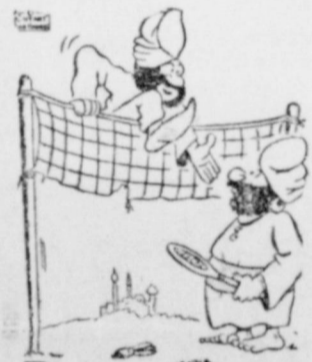
BADMINTON WAS PLAYED BY THE NATIVES OF INDIA. IT WAS ORIGINALLY CALLED "POONA".