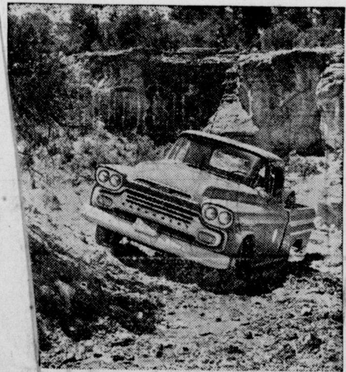
Up a steep mud-choked wash—Positraction pays off!

Representing Jefferson Standard LIFE INSURANCE COMPANY Home Office Greensboro, N.C.