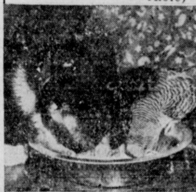
SNACK TIME —Cat and parakeet, supposedly natural enemies, regularly share saucer of milk at Albany, N.Y. home.