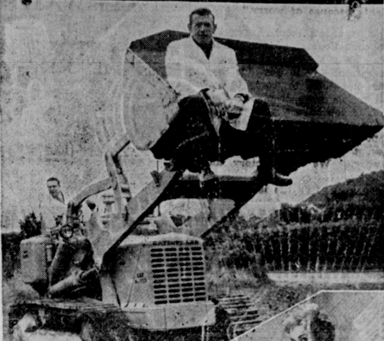
SITTIN' ON TOP of the world these days is Ingemar Johanson (above), new world's heavyweight champ. Boxing sensation who defeated Floyd Patterson gets a lift from the new front end loader he purchased recently for his contracting firm in Sweden.