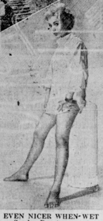
EVEN NICER WHEN WET —Sandra Dee, teenage starlet appearing in the film "A Summer Place", models simple shirt-tail being worn by some teenagers at the beaches this summer.