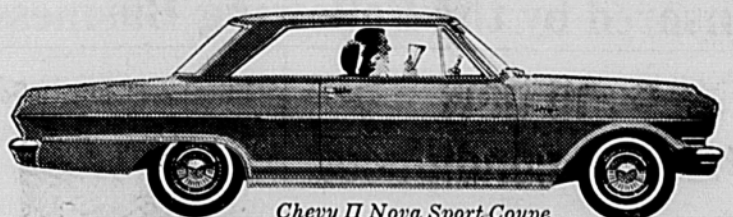
Chevy II Nova Sport Coupe