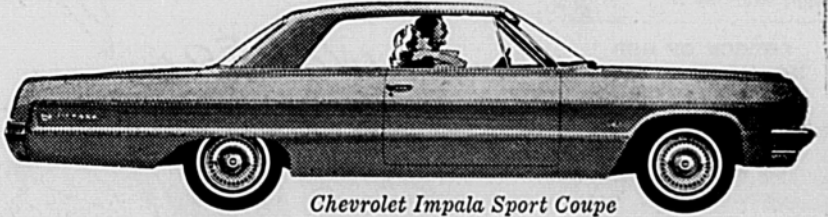
Chevrolet Impala Sport Coupe

Chevrolet dealers sell more cars than anybody Because they sell great cars