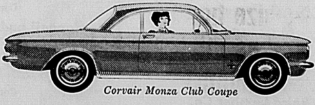
Corvair Monza Club Coupe

Chevrolet has brought a whole new kind of excitement to everyday driving this year—with 5 different lines of cars and 45 different models.