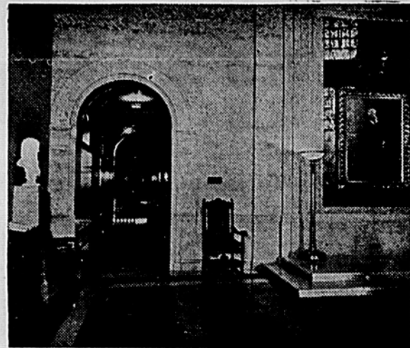
ARMSTRONG BROWNING LIBRARY — Entrance to the McLean Foyer of Meditation in the Armstrong Browning Library. The Cloister of the clasped Hands in this room contains Harriet Hosmer's cast of the clasped hands of the two poets.