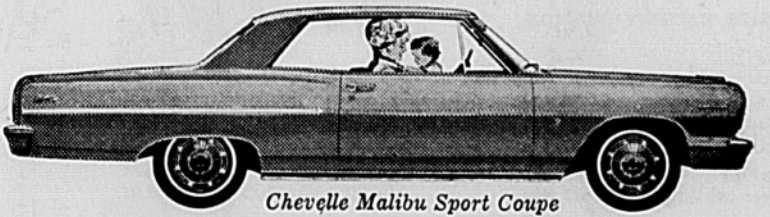
Chevelle Malibu Sport Coupe