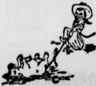
CENTRAL HIDE & RENDERING CO.

For Immediate Service PHONE 4-4001 COLLECT Abilene, Texas