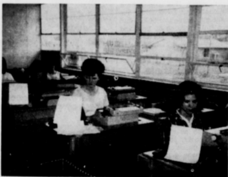
TYPING CLASS — Students in this class have the opportunity to increase their typing speed with extra drills, etc.