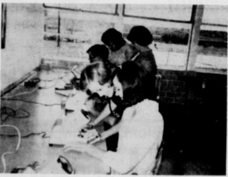
READING CLASS — Enables students to read at a much faster rate and better understand what they have read.