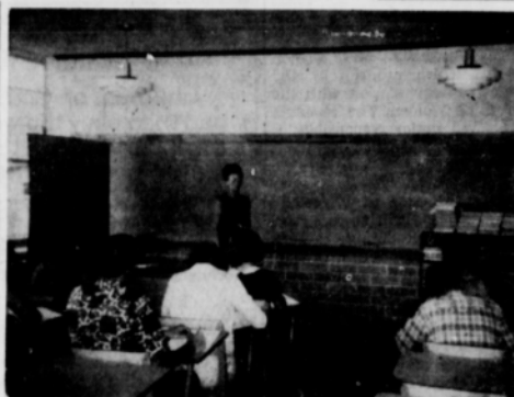
ENGLISH CLASS — Gives added English hours to students and helps them understand the subject better.