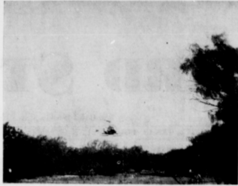
Aerial spraying mesquite on George Ranch with helicopter equipped with boom-type spray.