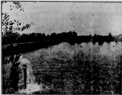
ARTESIAN WELL AND LAKE