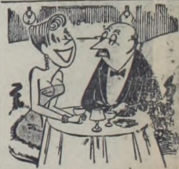
"Gosh, if they'd just give me the $12,000 it takes to make just one job, I wouldn't clutter up the labor market!"

farm, according to the specialist or for gasoline used for other than actual farming purposes, as described in Form No. 2240. This applies to gasoline used on the highway, for personal use such as mowing the lawn, or for processing, packaging, freezing, or canning operations. Sufficient records should be kept to enable the Internal Revenue Service to verify the accuracy of the refund claimed.