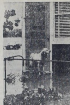
WET DOGGIE . . . Sad pup awaits rescue as heavy rains flooded Philadelphia, northern end of Hurricane Connie which lashed Atlantic coast.