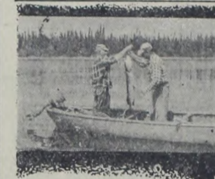
Thirty-pound Lake Trout... 20-pound Northern Pike... and five-pound Brook Trout are not uncommon in the numerous lakes, rivers and streams of Manitoba.

Spring and fall provide the most thrilling Trout sport. Then the Lakers are found covorting close to the surface, ready to do battle with all comers. Manitoba, incidentally, for 24 years held the world's record for the largest Lake Trout ever landed with hook and line — a whopping 63-pounder!