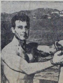
SOME KICKER! . . . Jack Lallane, Oakland strong man, swam, handcuffed, 2 miles from Alcatraz Island to Fisherman's Wharf in San Francisco in 56 minutes.

OPTOMETRIST 105 AVENUE F—NF (½ Block East of Court House) CHILDRES, TEXAS