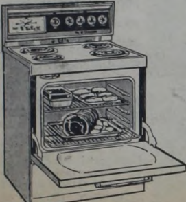
27" Electric Model RD-38-62 FRIGIDAIRE PRODUCT OF GENERAL MOTORS