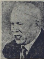
This man wants peace—but on his terms. One way we can help our government negotiate with him is to keep financially strong.

United States Savings Bonds are guaranteed to grow 33 \frac{1}{4} % bigger by maturity. Start buying them today. Each one you sign up for will add that much more security to your country's future—and your own.