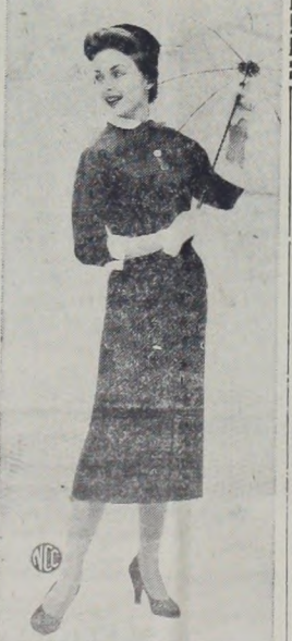
Rain doesn't bother this pretty girl, for she knows her sturdy cotton suit will stay crisp and fresh. Designed by Minx Modes of St. Louis in ranchtone cotton, this trim suit is a wardrobe asset, for it adapts to many occasions.