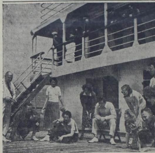
A happy group of travelers watch a fast (?) turtle race on the sports deck of the S S Kent bound for Nassau, in the Bahamas. Operated by the Merchants and Miners Transportation Company, the S S Kent provides luxury overnight passenger service between Miami and Nassau. Because of its international reputation and its position well within the neutral zone of the Western Hemisphere Nassau is enjoying unusual popularity with American travelers this winter.

quickly as he himself had taken off; but "The Kid" returned to complete the third episode of the evening—and drew a bye.