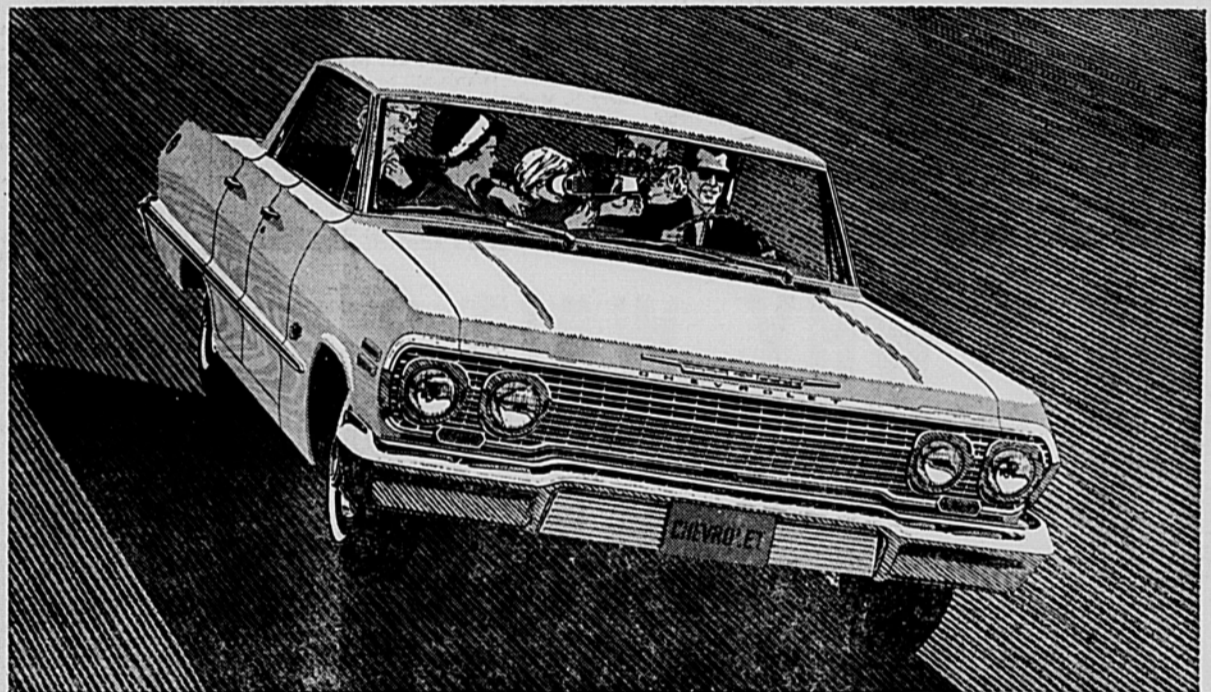
'63 CHEVROLET IMPALA SPORT SEDAN