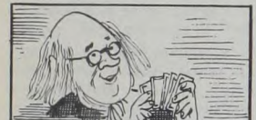
Benjamin Franklin was one of the first people to manufacture playing cards in America.