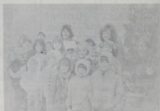
Quitaque Girl Scouts, Troop #217, Troop #366, Troop #420 Decorate Mini Park Tree on a Cold December Friday

Santa's visit will be sponsored by the Quitaque Lions Club.