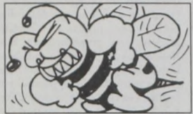
Stinging requires a bee to use 22 different muscles.

The City reserves the right to accept or reject any or all bids. 52 2tc