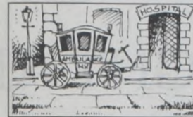
The first hospital to use ambulances was Bellevue in New York City in 1869.

A hamburger cookout was enjoyed by all on Saturday with a barbecue on Sunday.