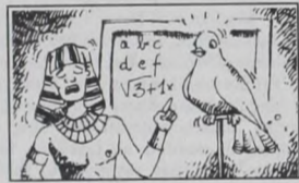
About 5,000 years ago, pigeons became the first tamed birds, experts believe.

"Momhood" makes for many days of laughter. I get so much joy out of watching my sons learn things from the stumbling blocks to the successes. As a mom I hope to instill in my sons the pride I feel in being a parent that has had the wonderful opportunity to love, grow, and share with them through our journey of life.