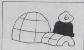
Air conditioning was invented in 1902.