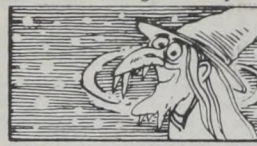
In Germany, Jack Frost appears as an old woman. When Old Mother Frost shakes her bed, snow begins to fall.

Cookie sales are going great and will continue through February 8th.