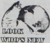
LOOK WHO'S NEW