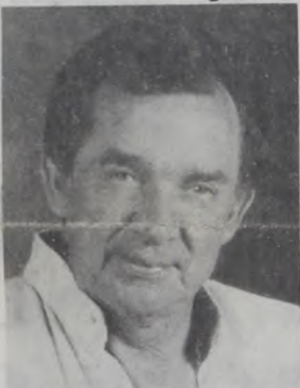
LEGENDARY RAY PRICE

The City of Quitauque received $1,392.96 for this pay period compared with $1,118.09 last year making a total of $21,501.05 for the year, an increase of 10.44 percent.