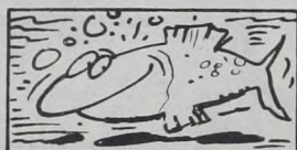
The herring is the world's most widely-eaten fish.