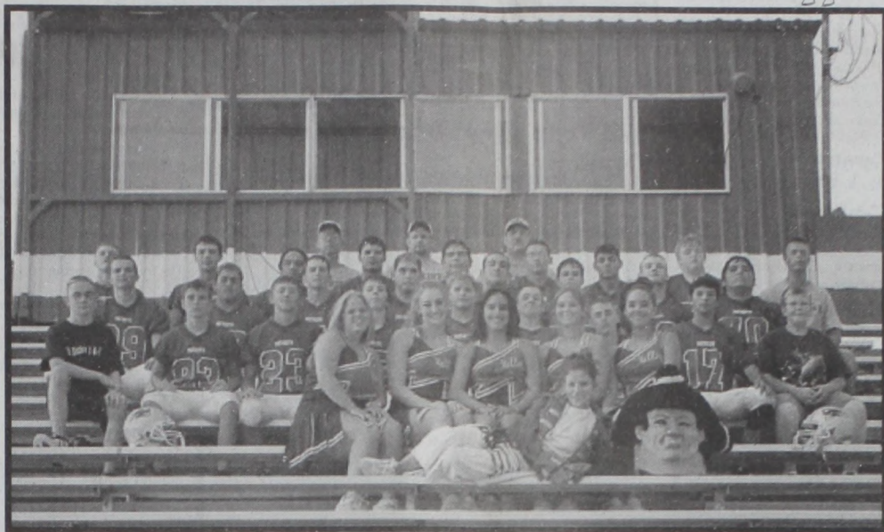
2003 VALLEY PATRIOT FOOTBALL TEAM CHEELEDERS & MASCOT