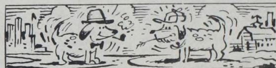
On the average, a city dog lives longer than a country dog—eleven years compared to eight.

School was dismissed Thursday at 1 p.m. December 22, 1988 for Christmas holidays.