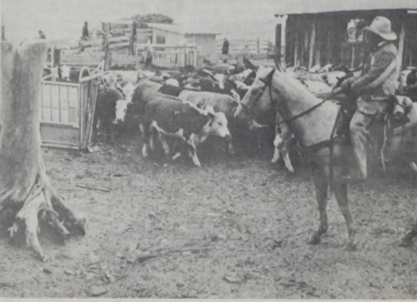
"Roundup" First Place Elton Cantwell, Snappy Shooters