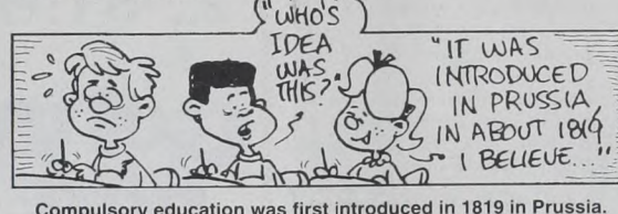
Compulsory education was first introduced in 1819 in Prussia.