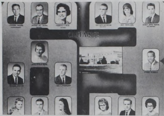
Class of 1963