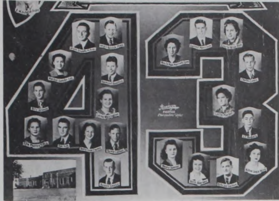
Class of 1943