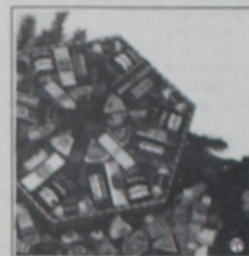
Gift packages such as the Figi's "Holiday Feast" are popular time-savers during the holidays.

Two places to which the holidays really appeal: the heart, and the taste buds. For most people, special delicacies are among the foremost joys of Christmas. In fact, historians say that year-end festivities of ancient European peoples included huge feasts lasting for days and these led to special foods becoming an important part of Christmas celebrations throughout the world. Whether it's the roast boar of old England, the candy-filled Pinatas of Latin America or the visions of sugar-plums that dance in the heads of American youngsters, Christmas is a time to enjoy special celebrations and foods.