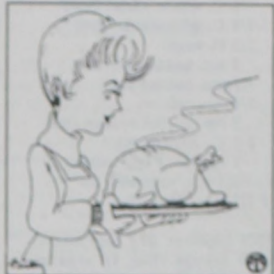
It's the season to stay healthy: Don't leave cooked turkey out all day—you may risk food poisoning.

Here's food for thought: By using your safety sense, you can protect yourself and your family from foodborne illnesses this holiday season.