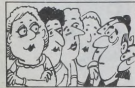
For every 100 women over 65, there are only 77 men.

The 27th annual anniversary of Bob Wills Day in Turkey, Texas is arriving very soon. On Saturday, April 25, 1998 Bob Wills Fans will be gathering at Turkey to celebrate the music of the King of Western Swing once again.