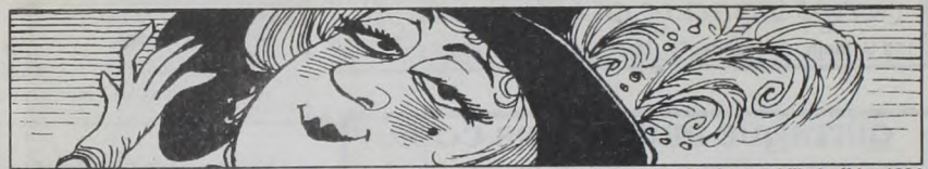
The Carolina parakeet, once common in the U.S., living as far north as New York, was killed off by 1904 because milliners wanted their bright feathers for the trimming of hats.

Daylight Savings Time Begins SPRING FORWARD 1 HOUR SUN., APRIL 5 2 A.M.