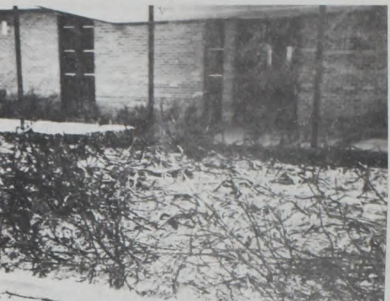
First Baptist Church was threatened by fire in the shrubs surround the church Wednesday before firemen extinguished it.